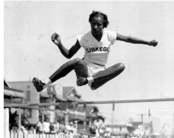
Alice Coachman 1923-2014

Alice Coachman was an African American athlete, who specialised in the high jump. In London in 1948 she became the first black woman to win an Olympic gold medal.