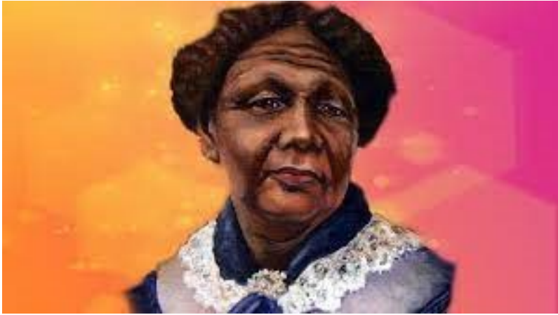
Mary Seacole 1805-1881

Mary Seacole went to help soldiers in the Crimean War.