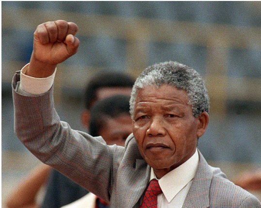
Nelson Mandela 1918-2013

Mary Seacole went to help soldiers in the Crimean War.