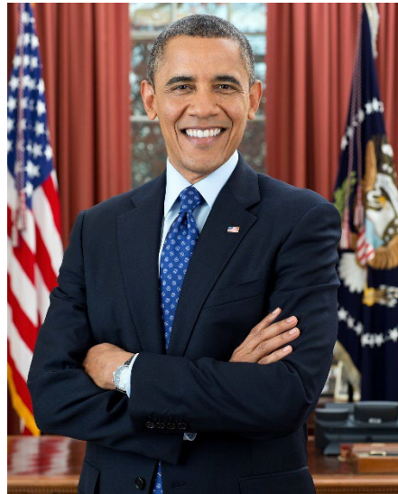
Barack Obama 1961- current

On November 4th 2008, he became the 44th American President. He is the first African-American president in the United States of America.