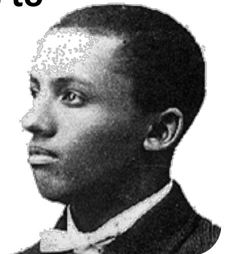
Carter G. Woodson

In 1987, the first Black History Month took place in the UK.