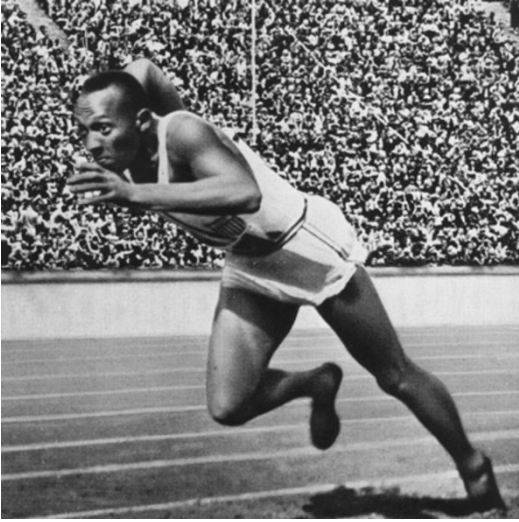
Jesse Owens 1913-1980

Jesse Owens, or 'Buckeye Bullet' as he was commonly known, was an American track and field athlete who took part in the 1936 Berlin Olympic, Germany.